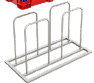
Easy in and Easy out