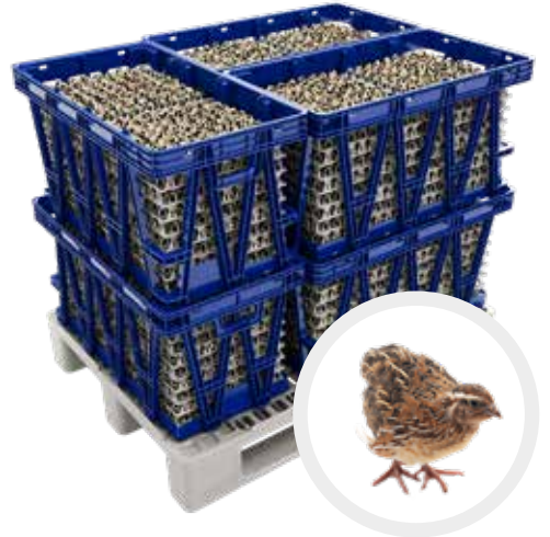
1152 QUAIL EGGS PER CRATE