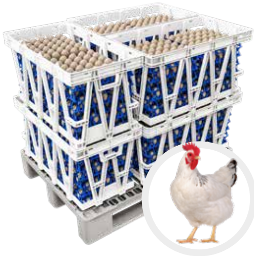
360 CHICKEN EGGS PER CRATE