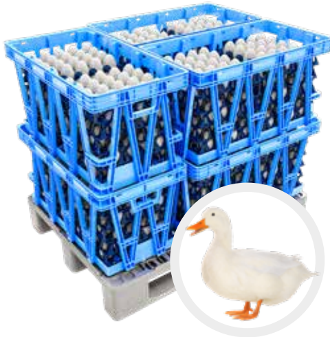
200 DUCK EGGS PER CRATE